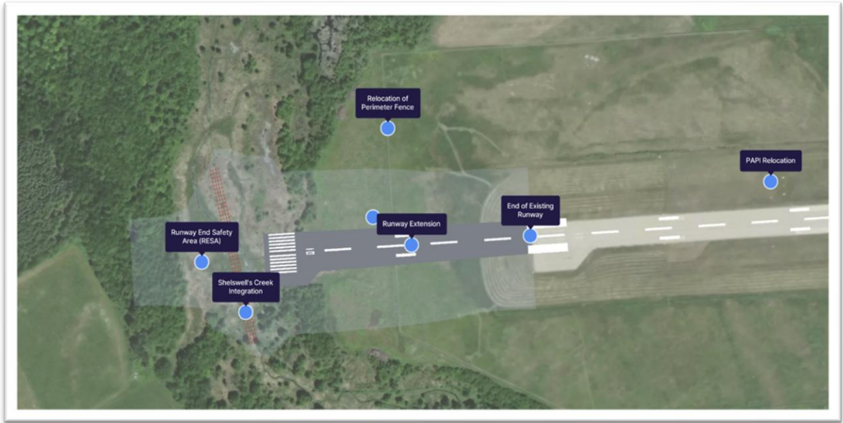
Figure 1: Runway 10-28 Extension Diagram