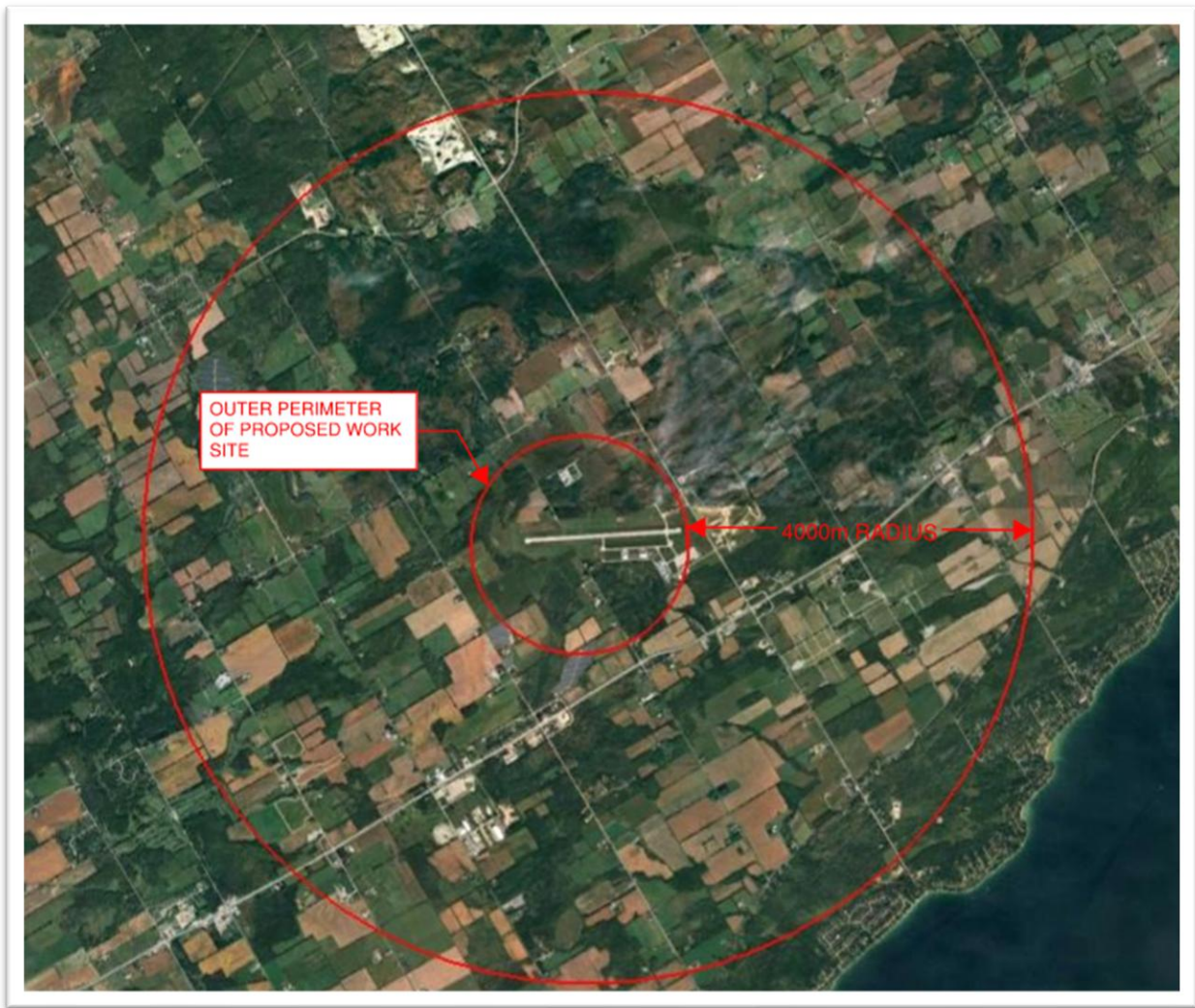
Figure 2: 4 km Notification Boundary per CAR 307 (Red Line)

Figure 2 below shows the mandated 4 km notification boundary drawn in red and in accordance with the regulation.